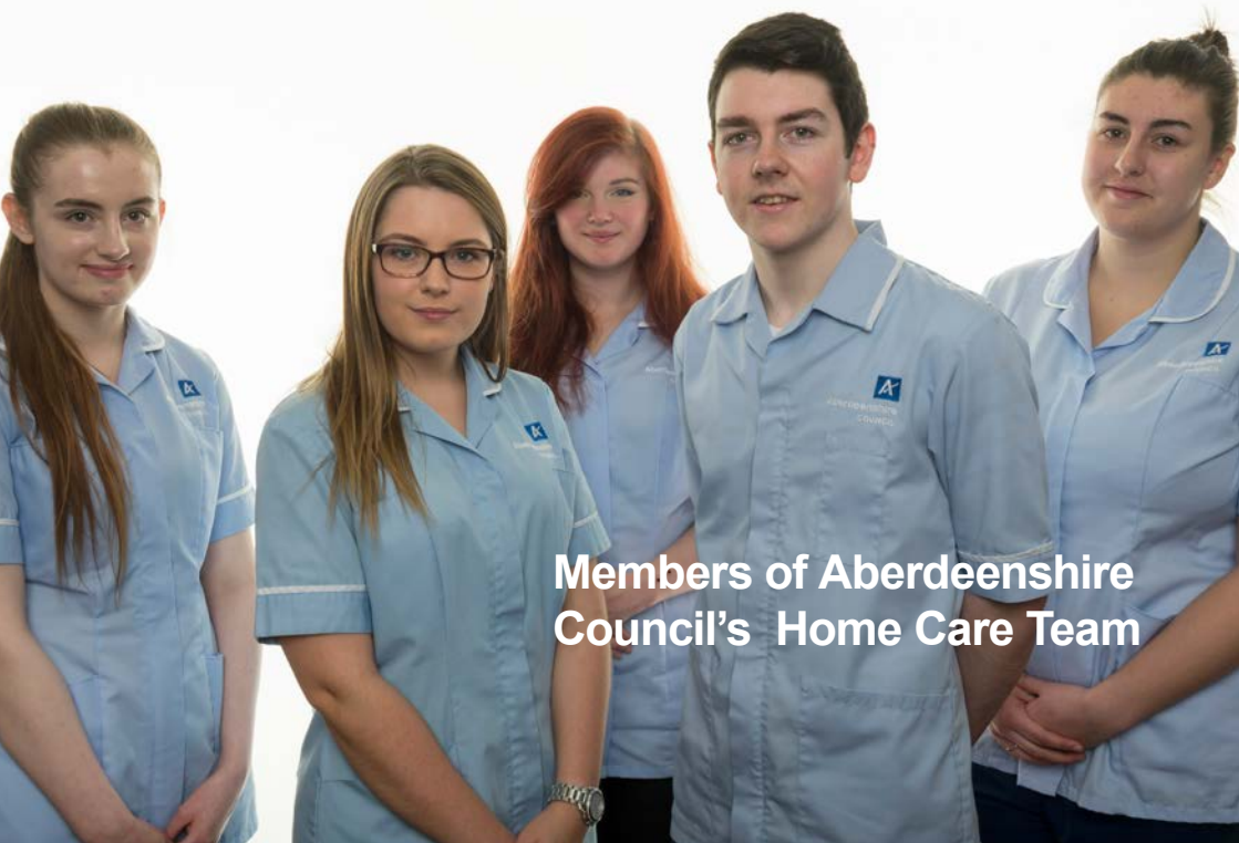
Members of Aberdeenshire Council's Home Care Team

If this sounds like a workplace that you want to be a part of, we are keen to hear from you!